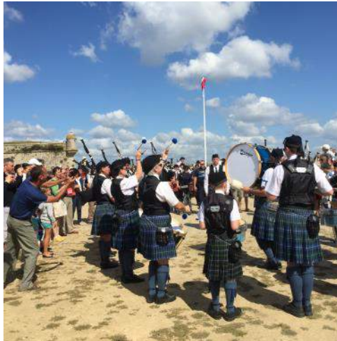
The City of Auckland Pipe Band playing at the historic fort at Port-Louis, Brittany