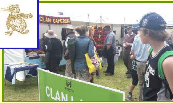
At the Hororata Highland Games: The busy Clan tent.