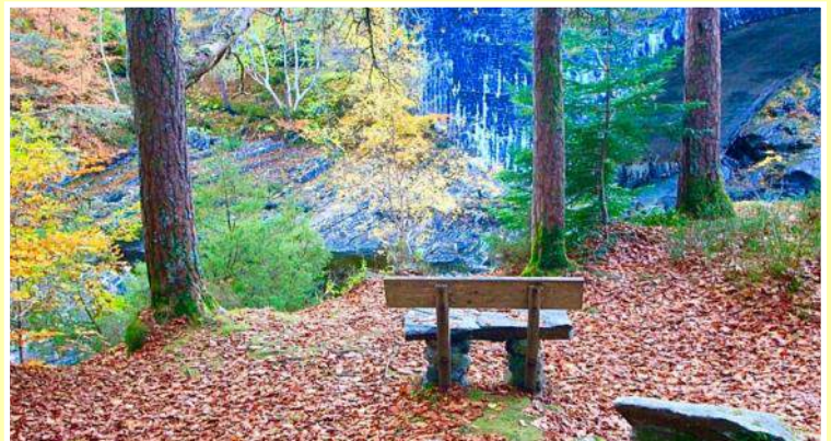
A Seat by the River. An Autumn photo by Bill Cameron