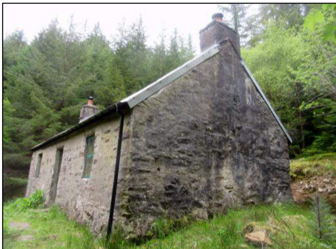
The old shepherds cottage in Glenhurich which is now called Resourie mountain bothy.