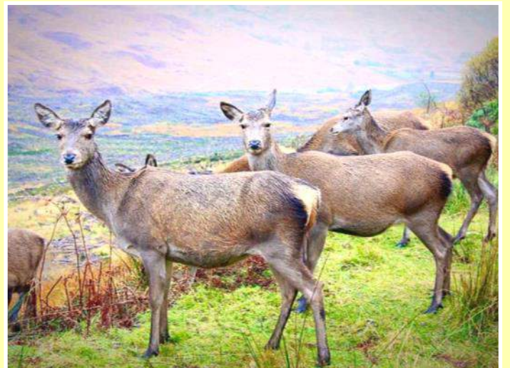
Deer in Glen Etive