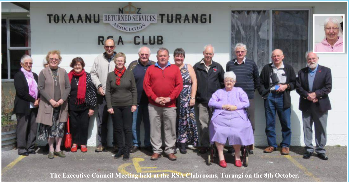
The Executive Council Meeting held at the RSA Clubrooms, Turangi on the 8th October.