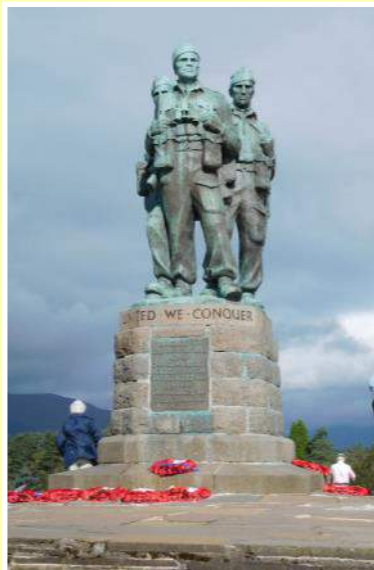
The Commando Monument