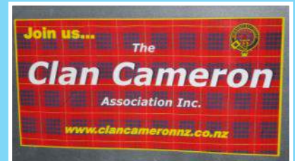
New decals on the CC Auckland trailer Note updated web site