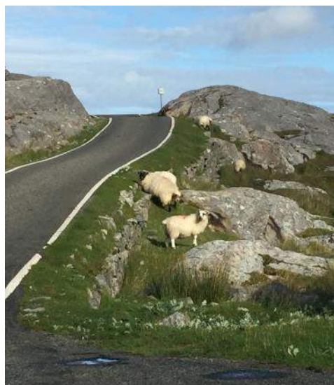
Road near Manish – typical single track with passing place at top, and sheep grazing