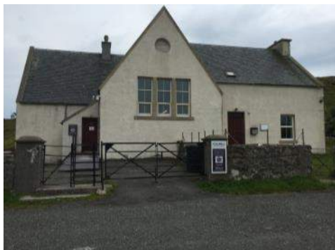
Drinishader school house – now home to Harris Tweed