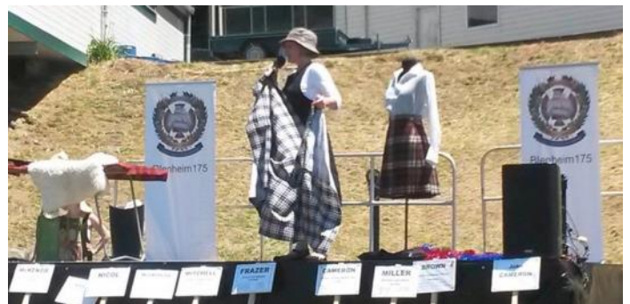
Kilt-making demonstration