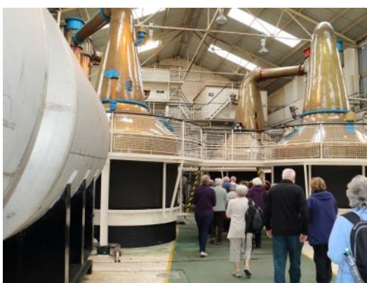
Inside the Still Room at Ben Nevis Distillery