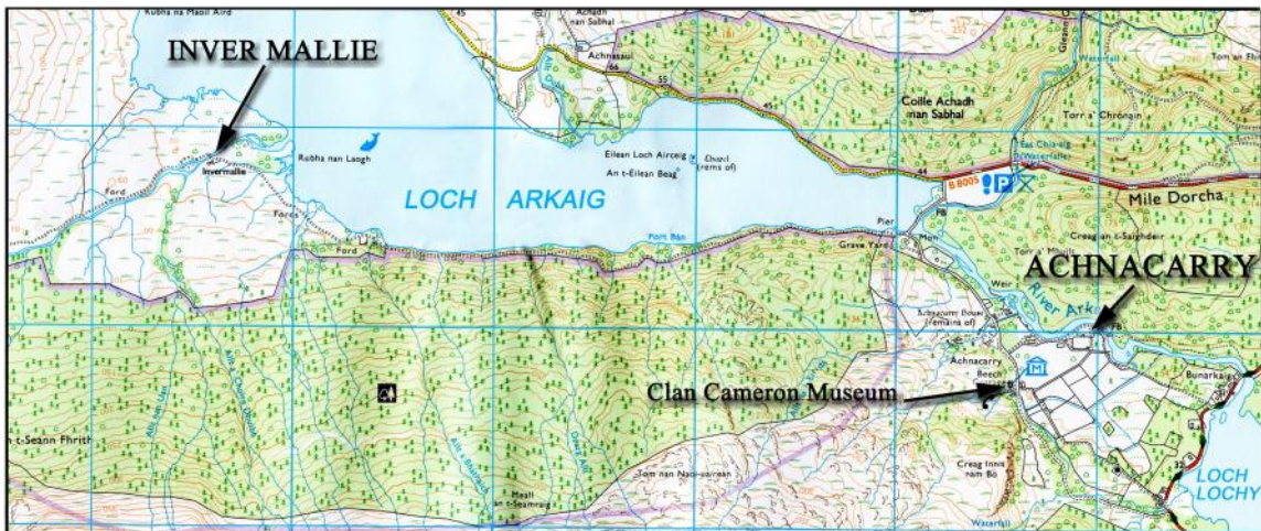
Diagram adapted from: Loch Arkaig (399) 1:25,000 Topographic Map, Ordnance Survey 2015 (Topographic data 2007) Croft GPS: 56°57'10.1"N, 05°03'59.0"W