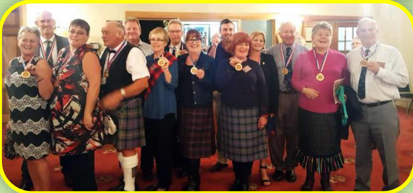
The winning team at the Gathering's "Indoor Highland Games"