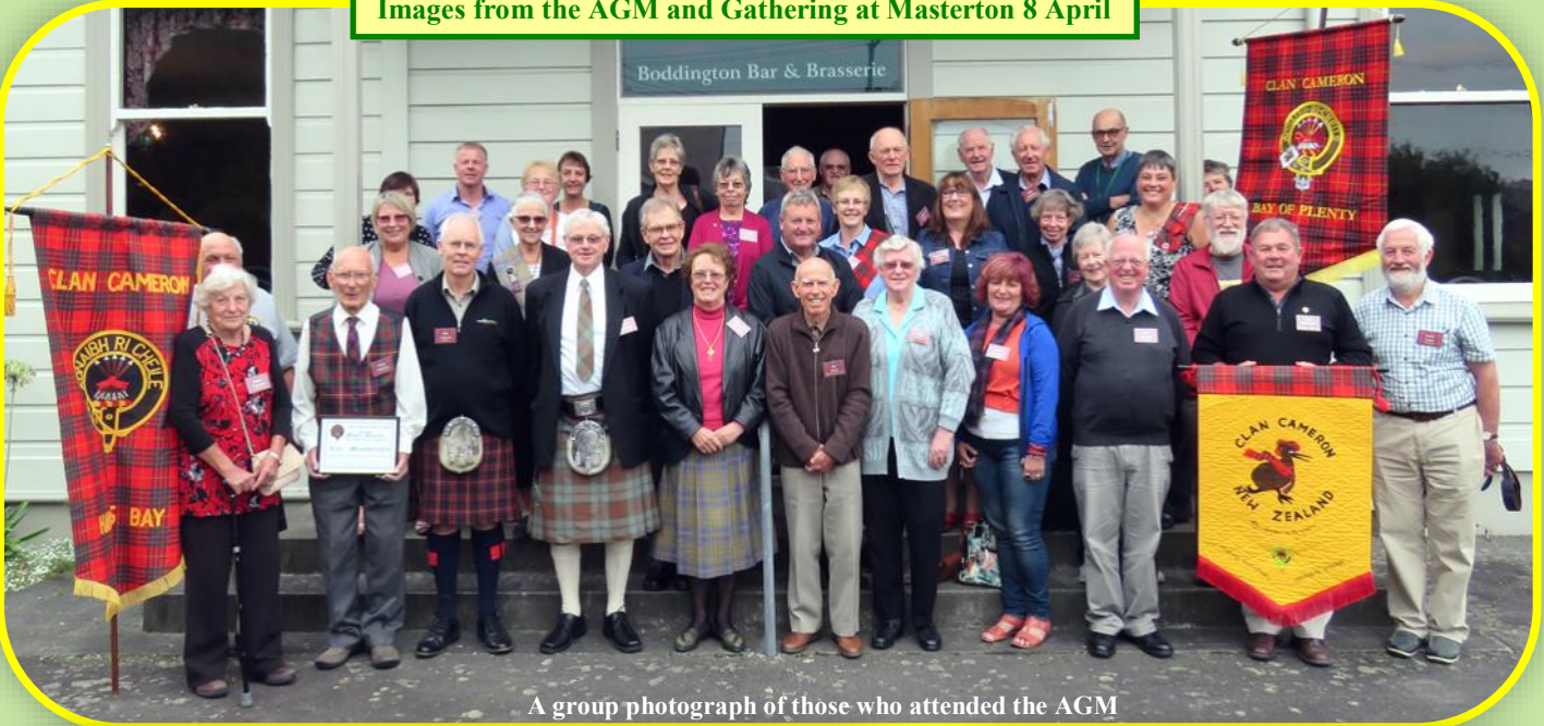
A group photograph of those who attended the AGM