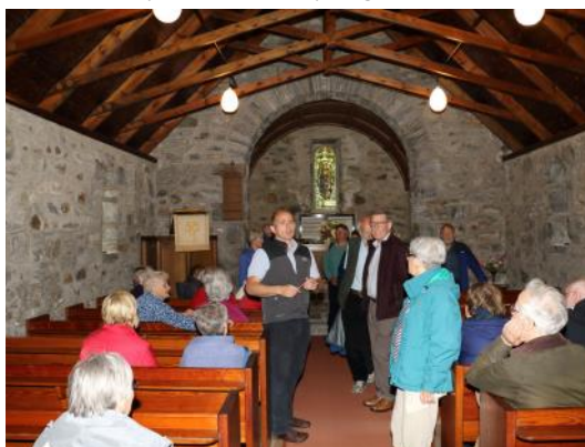
Inside St. Ciaran's Church, Achnacarry.