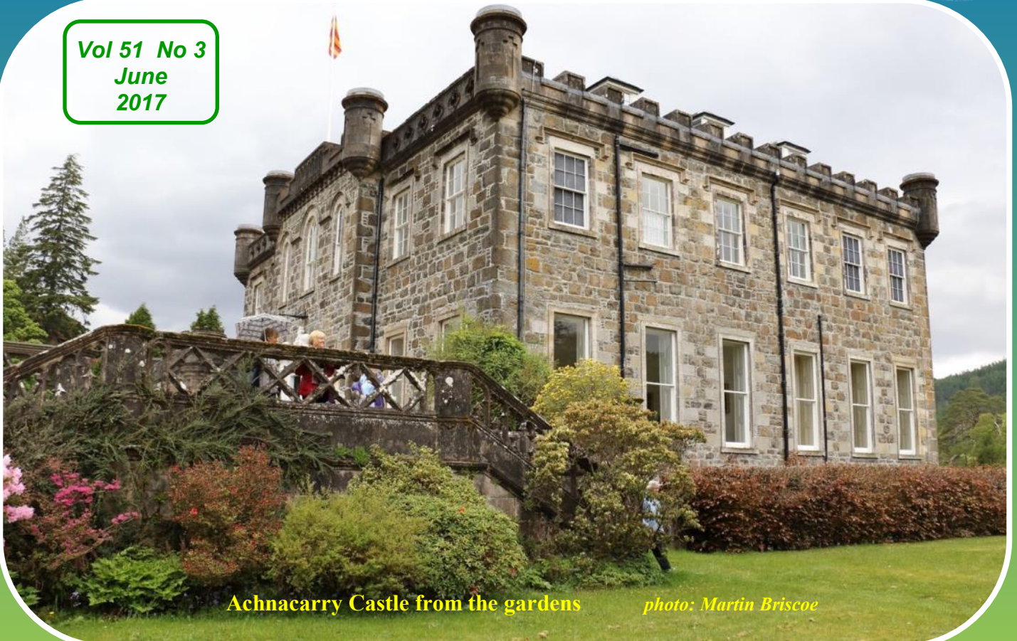
Achnacarry Castle from the gardens