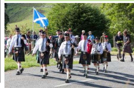
Rangitikei Scots Pipe band leads the march to the Memorial Ionic Cross to Robert Bruce.