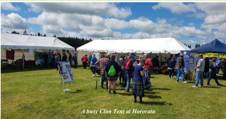
A busy Clan Tent at Hororata