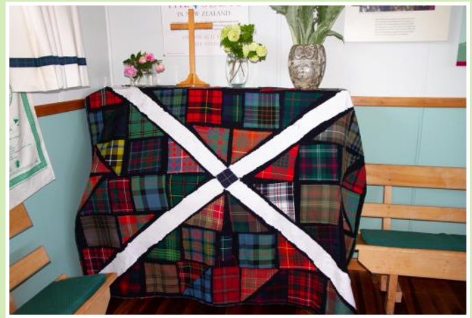
Ross Duncan's patchwork flag