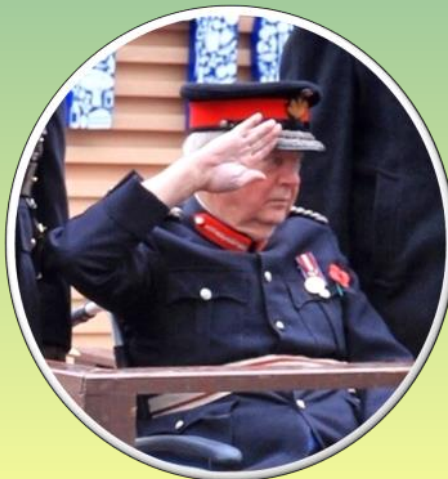
Armistice Day in Lochaber