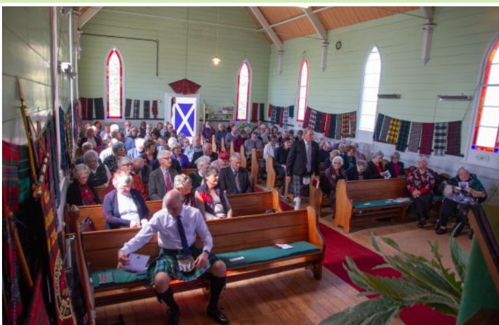
The Kirkin' o' the Tartan Service