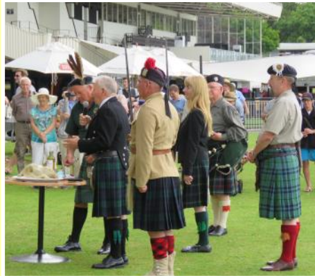
The Haggis Ceremony