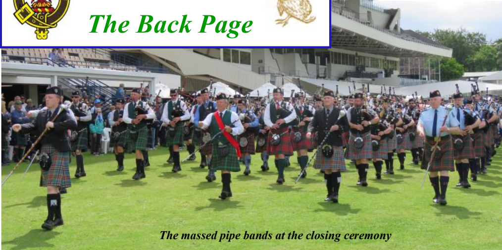
The massed pipe bands at the closing ceremony