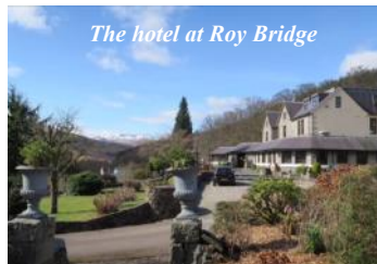
The hotel at Roy Bridge

I have not priced the trip up at all - there are so many