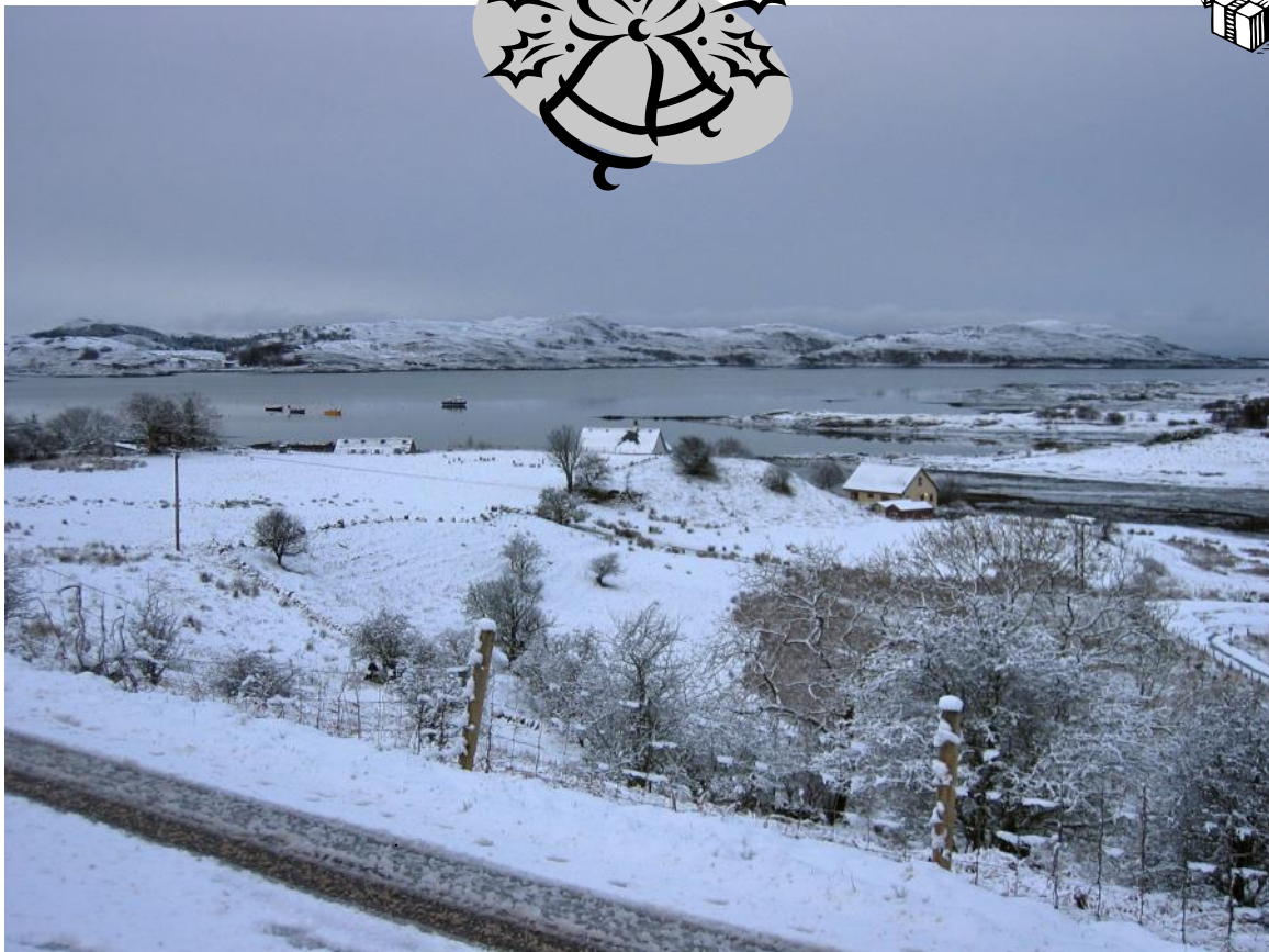
New Year in the Highlands. A scene looking towards Eigg, photographed by First Lighter Heather in January 2005.