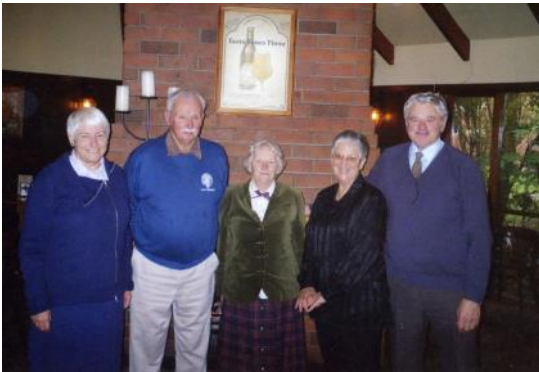
Clockwise from top left: