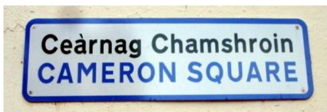
Two photos of the nameplate at Cameron Square in Fort William.