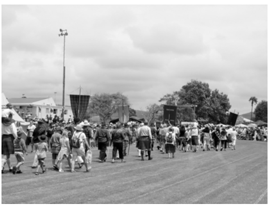
Some of the clans march past