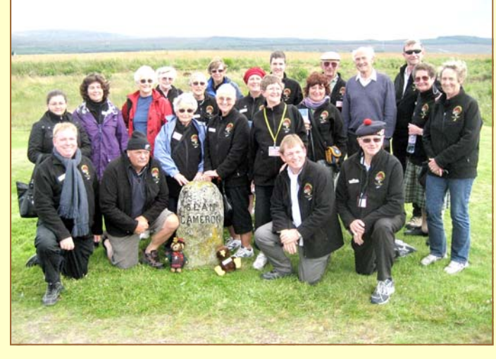
The Cameron Tour Party at the Cameron Stone, Culloden.