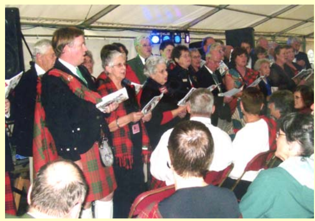
At the Achnacarry Ceilidh