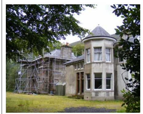
Callart House today