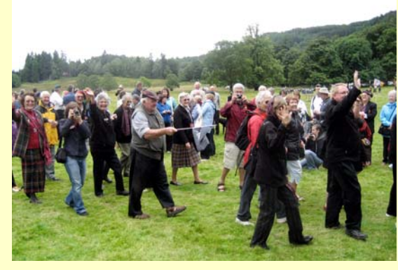
New Zealand Camerons in the Clan Parade