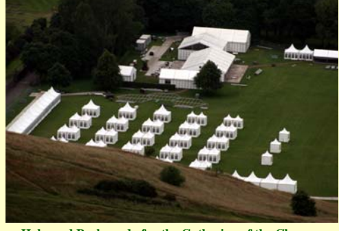
Holyrood Park ready for the Gathering of the Class