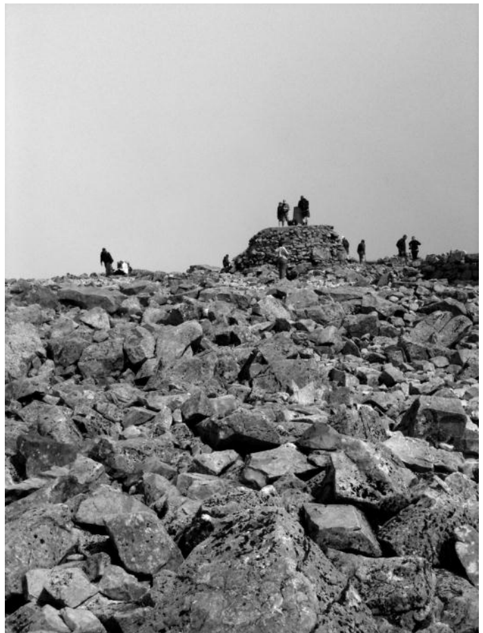
A Study in Black and White - The summit of Ben Nevis as seen by Tristan and Bill last week.