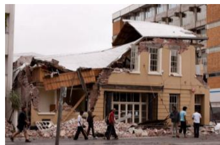
The Caledonian Hall, Christchurch, after the earthquake. See Canterbury news on page 2