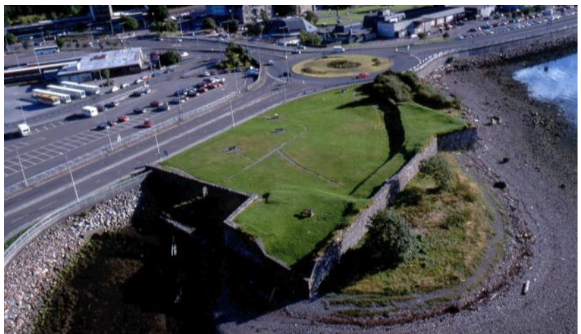
Aerial view of the remains of Fort William. One of the only few remaining features is the Sally Port seen in the middle of the wall on the left hand side.

A local group of volunteers have recently gathered to form (FOOF) friends of the old fort - with the intention of enhancing the remains of the Fort, improving access and putting together interpretative boards to educate visitors on the rich history of Fort William.