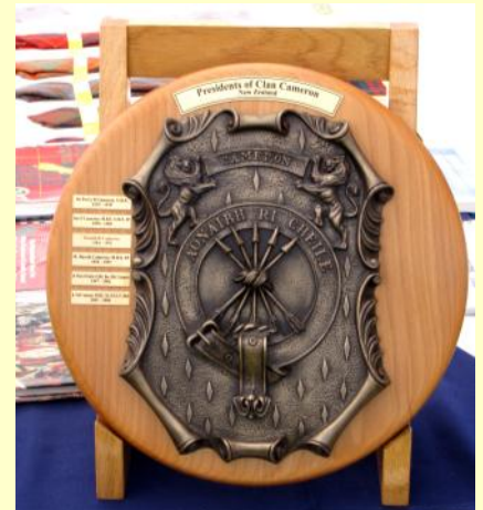
The President's Plaque, which has the names of all presidents inscribed