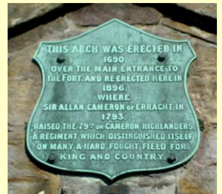
Another plaque, at Fort William - See page 7

W e have been asked the name of the river depicted in last issue's great photo. It is the River Arkaig (Abhainn Airceig), a fast flowing river about one mile in length which flows from Loch Arkaig, past Achnacarry, into Loch Lochy at Bun Arkaig. Thanks to "The Lochaber Geographic Compendium"