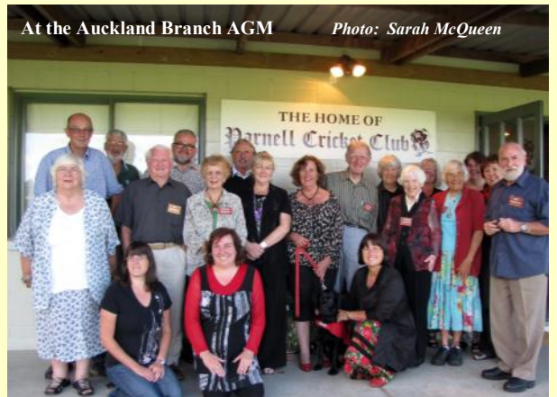
At the Auckland Branch AGM