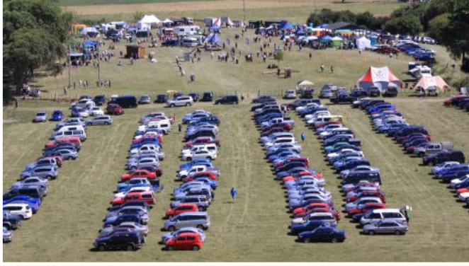
An aerial view of the Turakina Highland Games - Photo: Neville Wallace