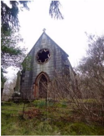
The Cameron Mausoleum

When we think of mausoleums or tombs, we might consider India's Taj Mahal or the pyramids of ancient Egypt. Such well known architectural masterpieces stand out as exclusive memorials to the celebrated deceased interred within them.