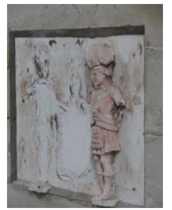
Part of the Cameron coat of arms