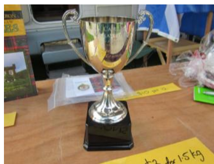
The cup presented to the winner of the Novice Tenor Drummer class to commemorate 25 years of Clan Cameron Manawatu