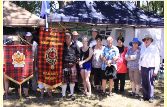
A good turn out at the Turakina Highland Games. - "A very successful day" Quote and photo by Neville Wallace