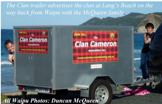
All Waipu Photos: Duncan McQueen