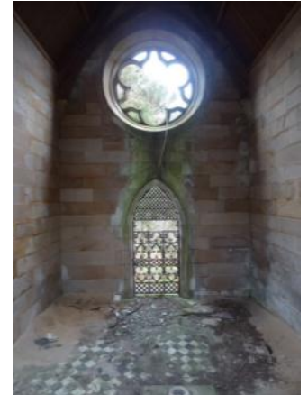
Interior of mausoleum

The Cameron mausoleum offers a unique architectural insight as to how the Camerons of Callart, (the oldest cadet family within the clan Cameron) intended to be commemorated in the afterlife. As a B listed building, the Cameron mausoleum stands out as an important part of our collective history and clan culture of yesteryear.