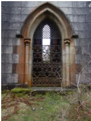
Gothic entrance to mausoleum

The entrance way to the mausoleum is guarded by a highly