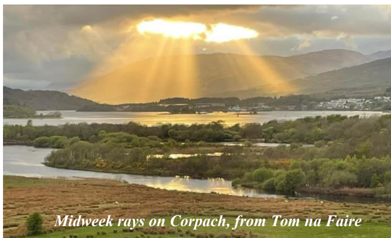
Midweek rays on Corpach, from Tom na Faire