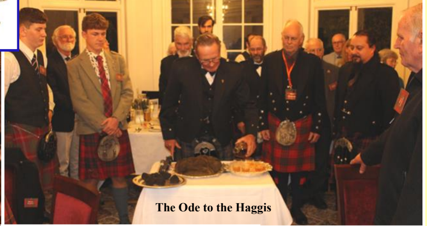
The Ode to the Haggis