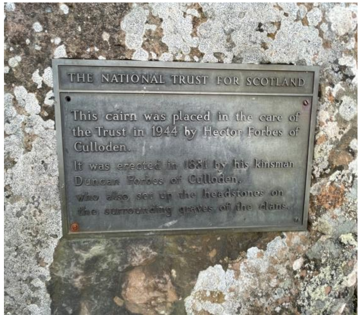
Plaque on the rear of the Forbes cairn.