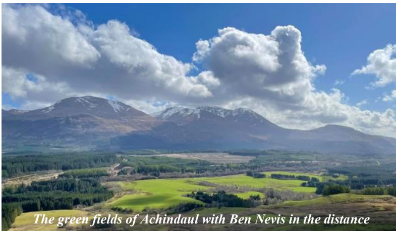
The green fields of Achindaul with Ben Nevis in the distance