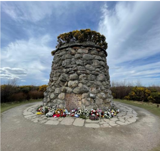
The Forbes Cairn where wreaths were laid at the 2022 Culloden commemoration.

2022 marks two hundred and seventy six years since that ill-fated day, when on the 16th of April 1746 The Duke Cumberland's troops killed between 1500-2000 Jacobites. Many more were left badly wounded. Those who did survive, lived the rest of their life with a price on their head for supporting the Jacobite cause.