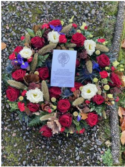
Wreath of the Clan Cameron associations of Scotland, North America, Australia, France and New Zealand?. New Zealand represented by the fern.