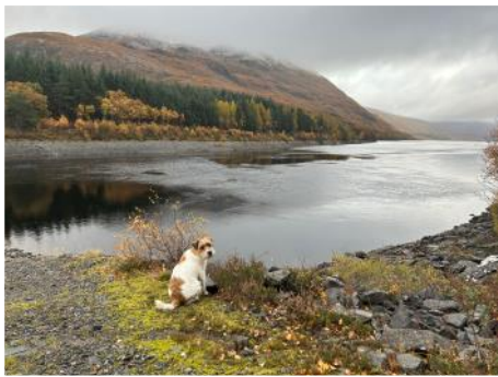
Beautiful Scotland. Left: with Toddy.