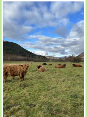
A rural scene