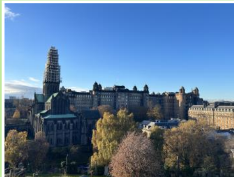
Centre: Glasgow Cathedral and the Royal Infirmary