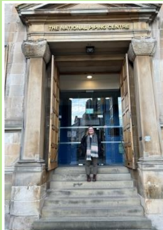
At the National Piping Centre, Glasgow where she will be studying