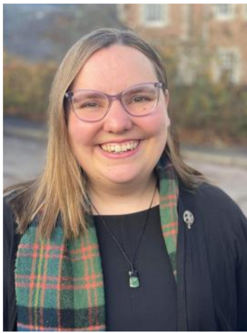
A Happy First Lighter.