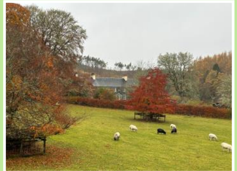
Right: Inverlair Lodge