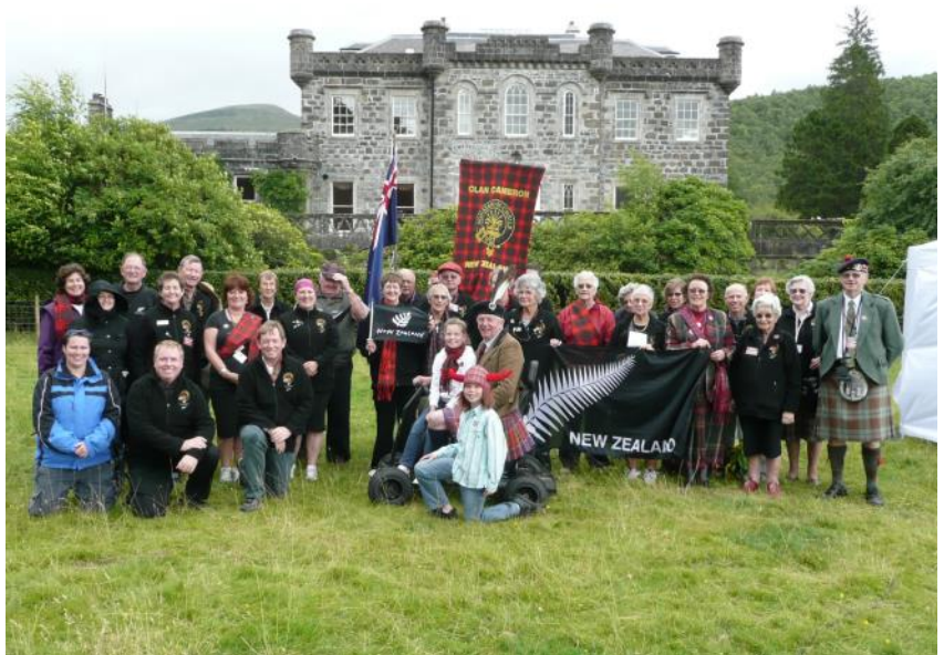
The 2009 Gathering. The New Zealand group, with some Trans Tasman Camerons, pose with the late Lochiel in front of the Castle.

Note that these are proposed or provisional – nothing set in stone. If we get decent weather, especially on the Saturday of course, that will really set the whole thing off nicely. There are also guided walks proposed as well, but nothing firm yet.