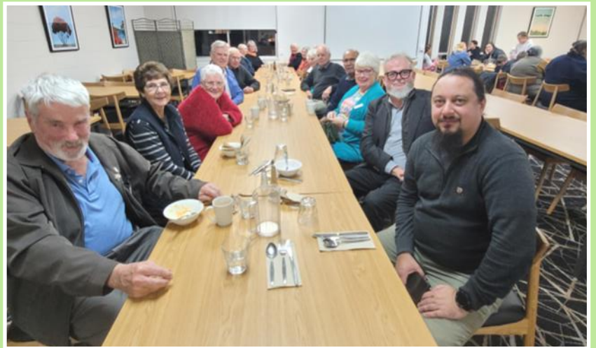
An enjoyable get together at the Napier RSA on the evening before the AGM.