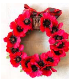
The Cameron wreath laid each ANZAC Day at the St Aidan's Church Cenotaph following a Service in the Church.