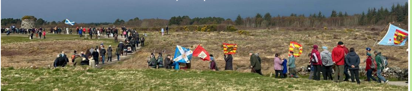
The Culloden Anniversary Service parade on a bleak Drumossie Moor.