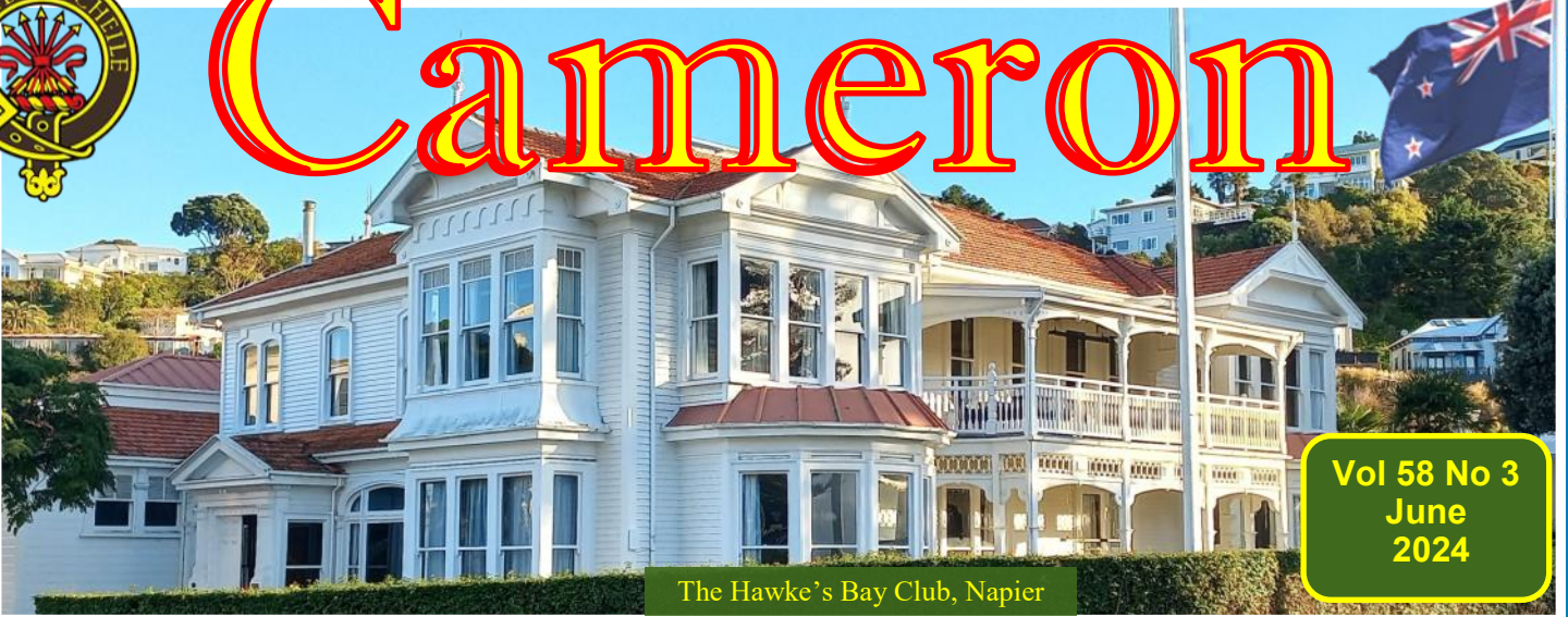
The Hawke's Bay Club, Napier