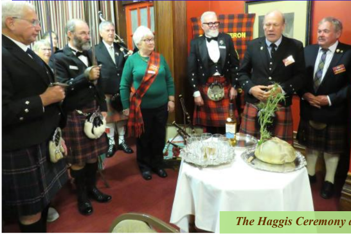
The Haggis Ceremony at the Gathering Dinner.