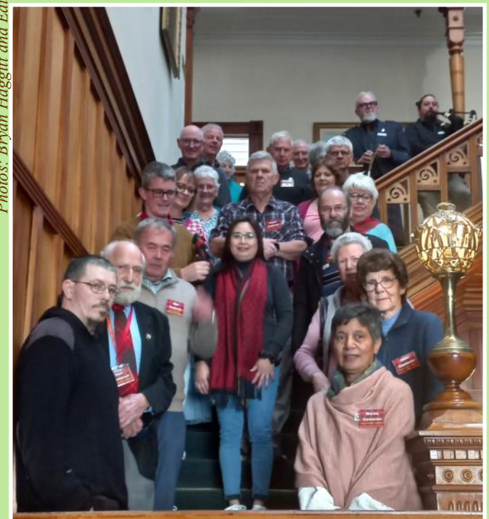
On the staircase after the AGM.