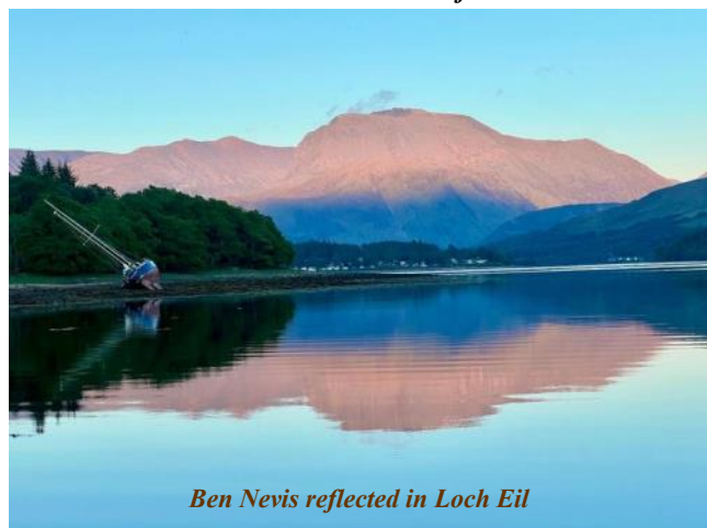
Ben Nevis reflected in Loch Eil