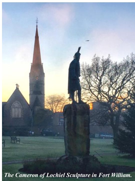
The Cameron of Lochiel Sculpture in Fort William.

I am still working on the idea and hope to give a further update in the next newsletter, as well as updating the clan Cameron Facebook close to the gathering.