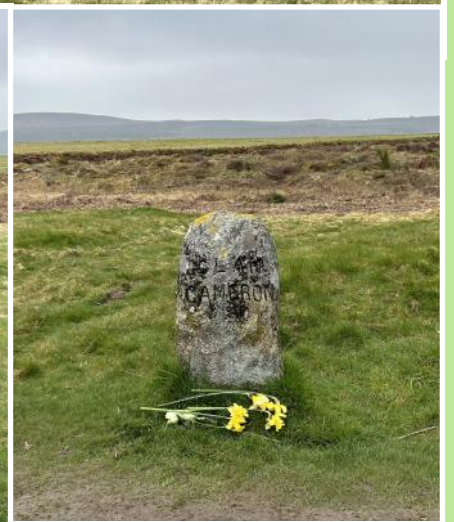
The Cameron Stone