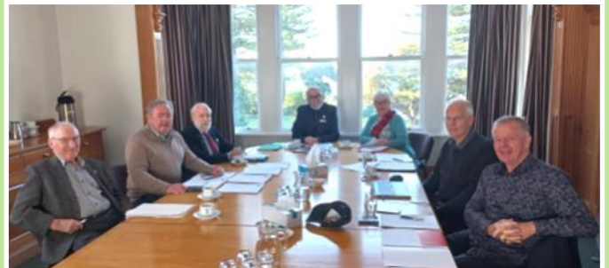
The Executive Council Meeting prior to the AGM and Gathering